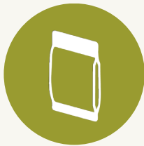
PILLOW BAG VERTICAL