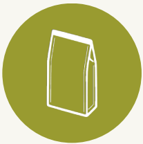
QUATTRO SEAL VERTICAL