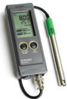
PPHM pH Meter

Handheld meters to read pH and Conductivity, suitable for use with our products. Ensures consistent monitoring of treatment solution.