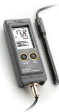
PCM Conductivity Meter