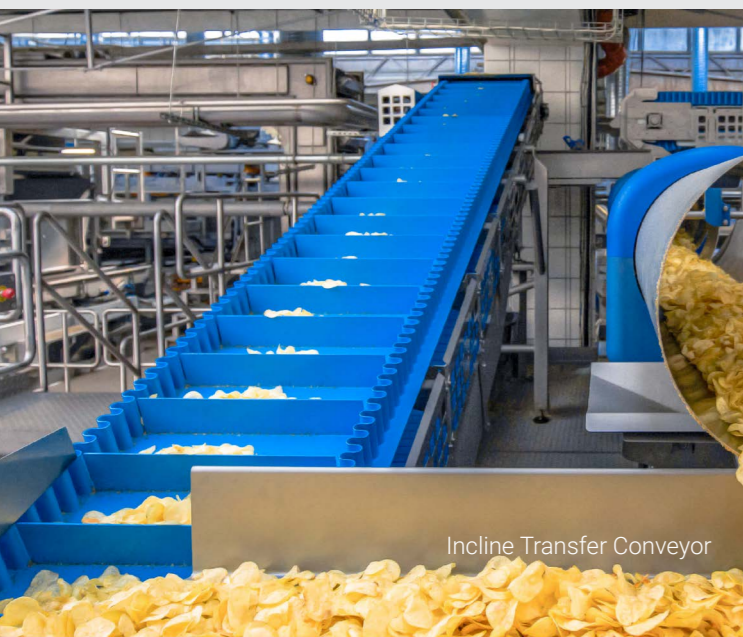
Incline Transfer Conveyor