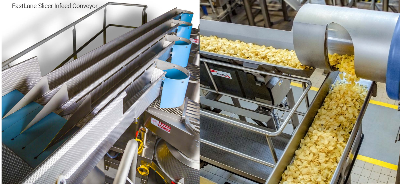
FastLane Slicer Infeed Conveyor