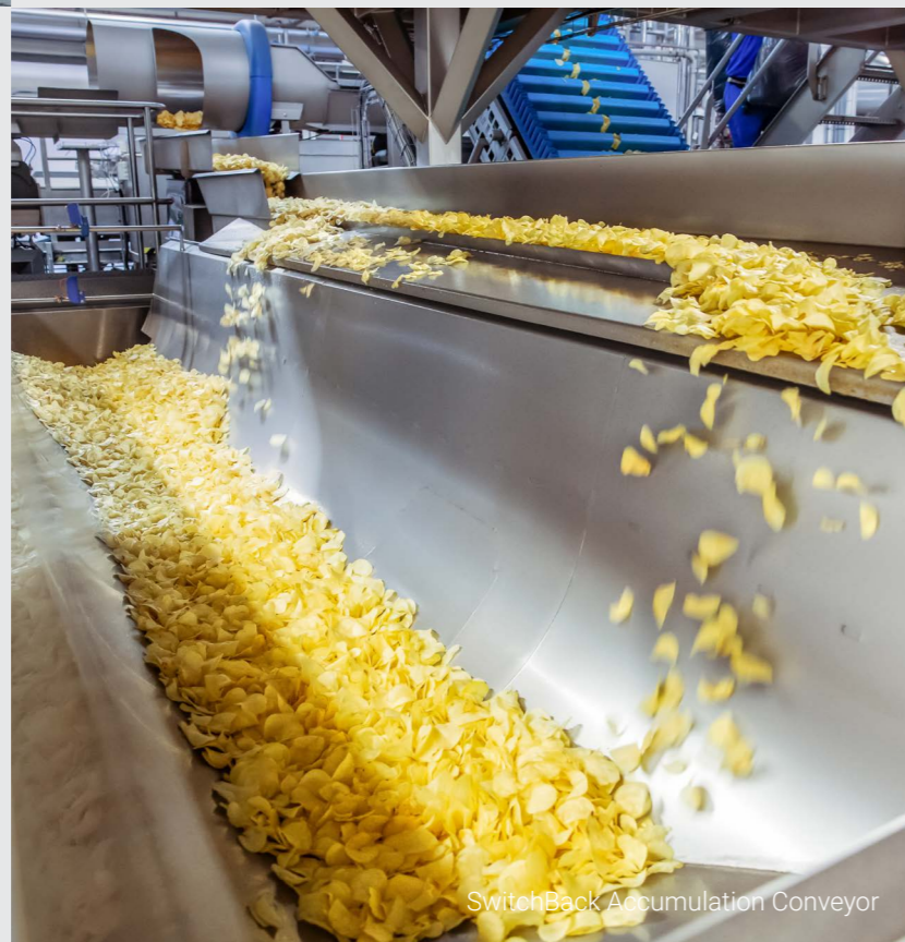
SwitchBack Accumulation Conveyor